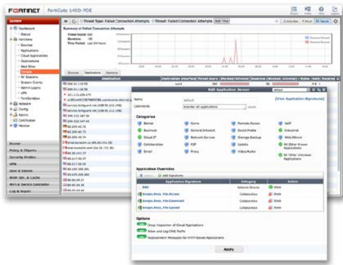
FortiOS Management UI — FortiView and Application Control Panel