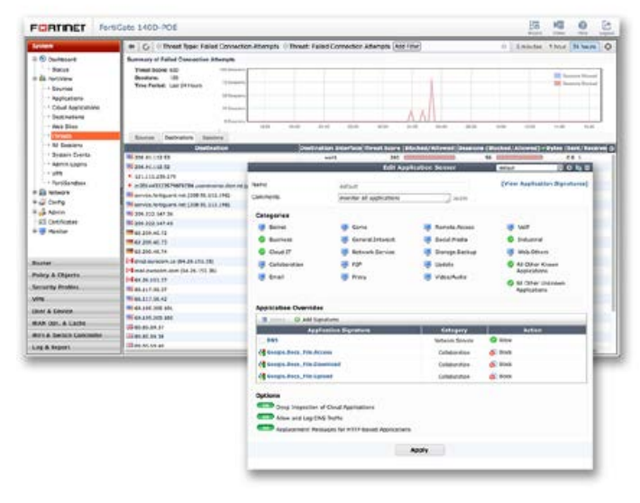
FortiOS Managment UI — FortiView and Application Control Panel